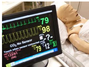
ALS Manikin and Monitor