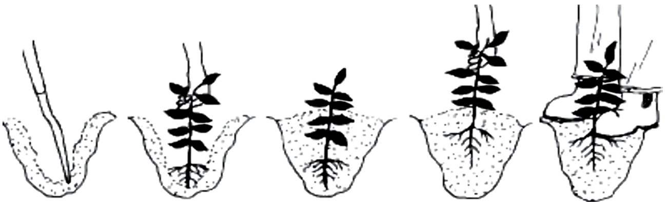
The positive pull technique for open rooted seedlings