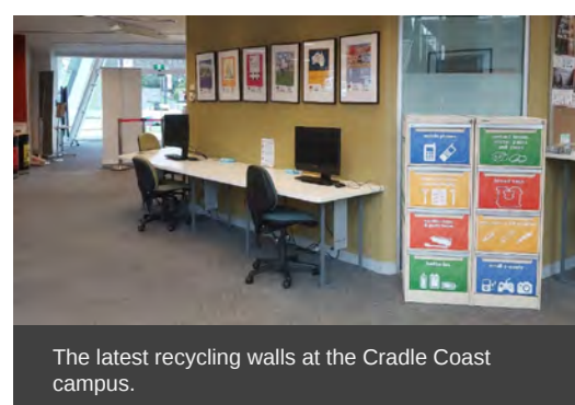
The latest recycling walls at the Cradle Coast campus.