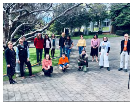
Members of the Sustainability team, Sustainability Committee and SIPS students

Find the new recycling walls at Newnham library, Inveresk Gallery and Inveresk Apartments, Rural Clinical School student lounge and the Cradle Coast Campus foyer.