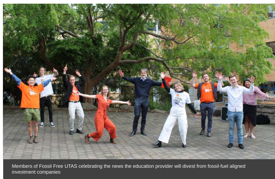
Members of Fossil Free UTAS celebrating the news the education provider will divest from fossil-fuel aligned investment companies