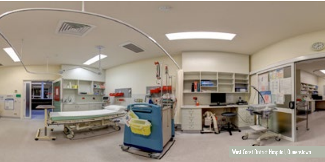
West Coast District Hospital, Queenstown