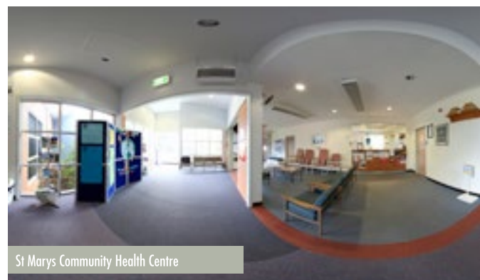
St Marys Community Health Centre