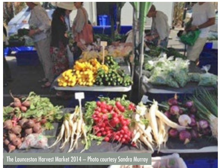
The Launceston Harvest Market 2014

For the purposes of the HFAT study the healthy food basket approach involved the collection of information,