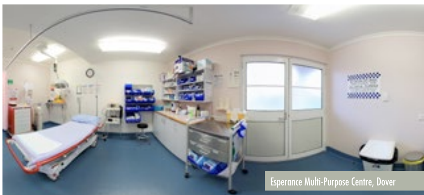
Esperance Multi-Purpose Centre, Dover