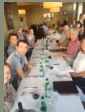
Benchmarking team at Warrnambool

Highly successful benchmarking workshops took place in Tasmania and at the Warrnambool campus of Deakin University in order to systematically compare the inputs, systems, processes and outputs for purposes of quality assurance and improvement.