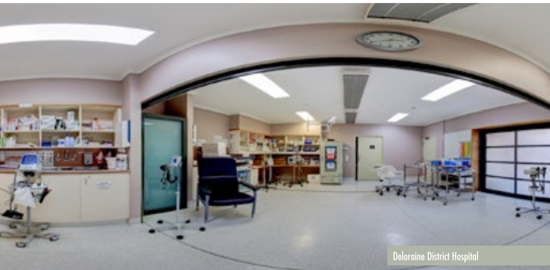
Deloraine District Hospital