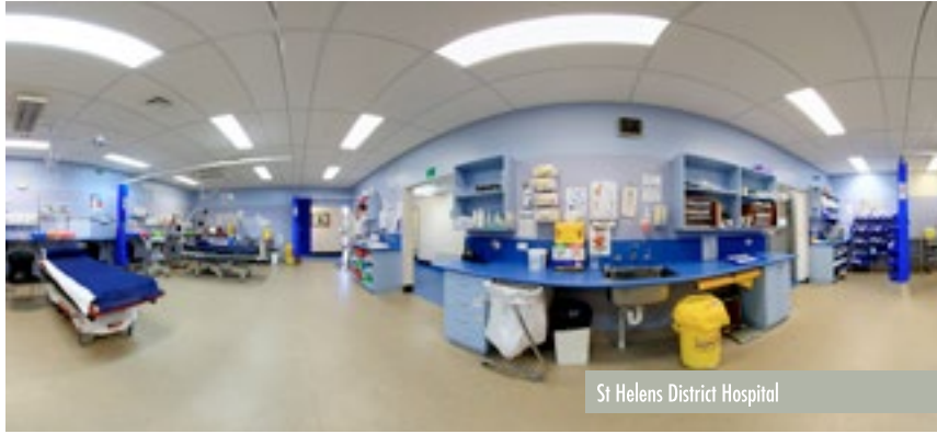
St Helens District Hospital