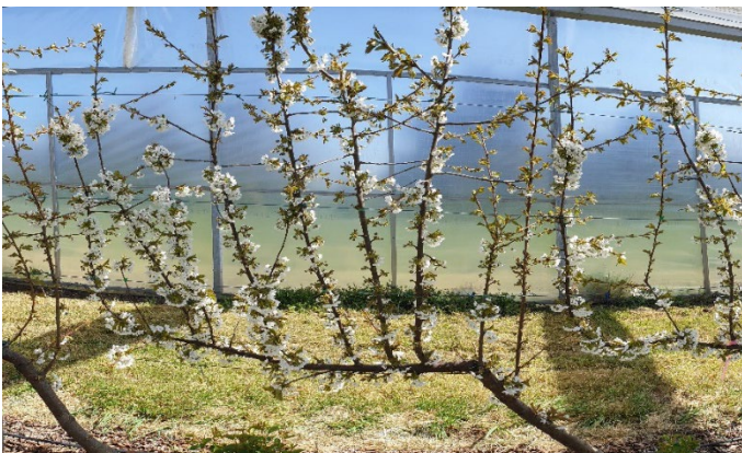
2D training system: 'Kordia' grafted to Krymsk 5 trained to the upright fruiting offshoot (UFO) structure under a Cravo protected cropping system