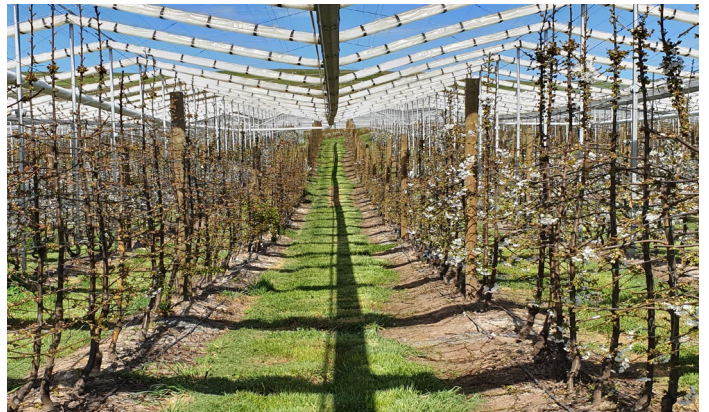
High density planting: 'Kordia' grafted to Krymsk 5 trained to the super spindle axe structure under a Cravo protected cropping system

Ideal crop loads for lateral bearing cultivars for each of these training systems is still unknown. Results from this study indicate that excessive fruit loads will result in poorer fruit quality (Figure 2).