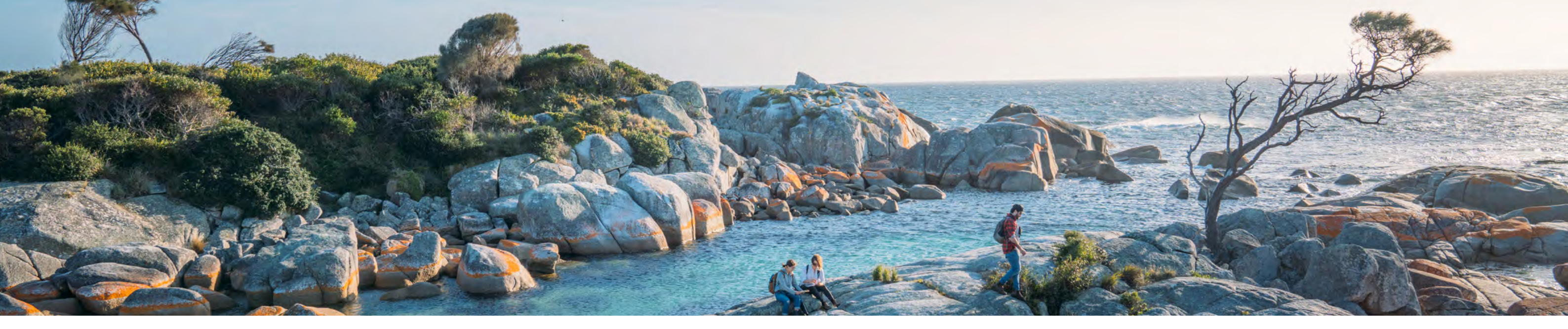
▲ IMAS students on a field trip at Binalong Bay, North East Tasmania.