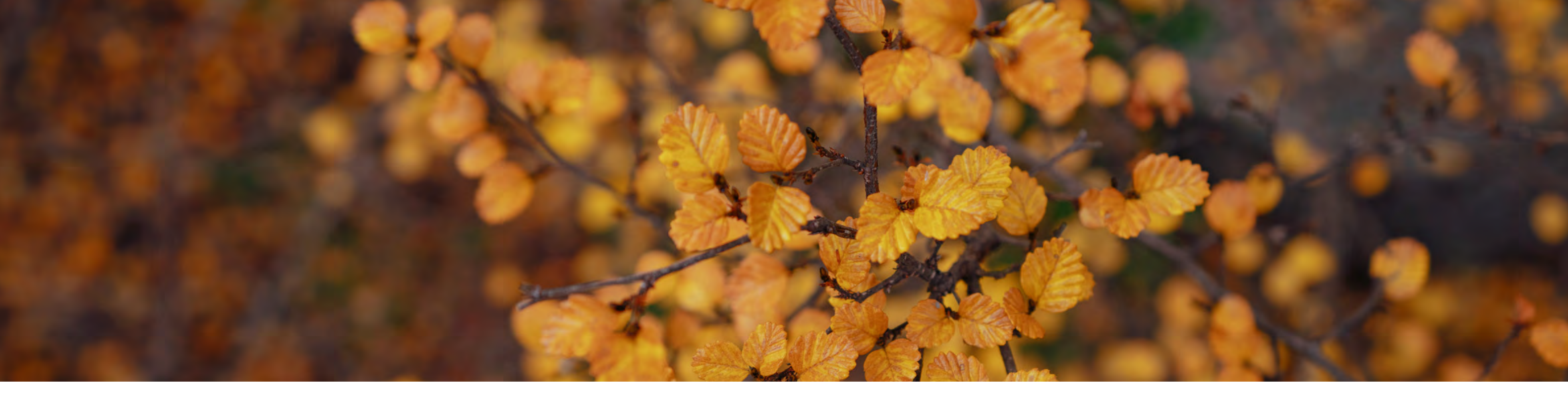
▲ Autumnal fagus, Mount Field, Tasmania.