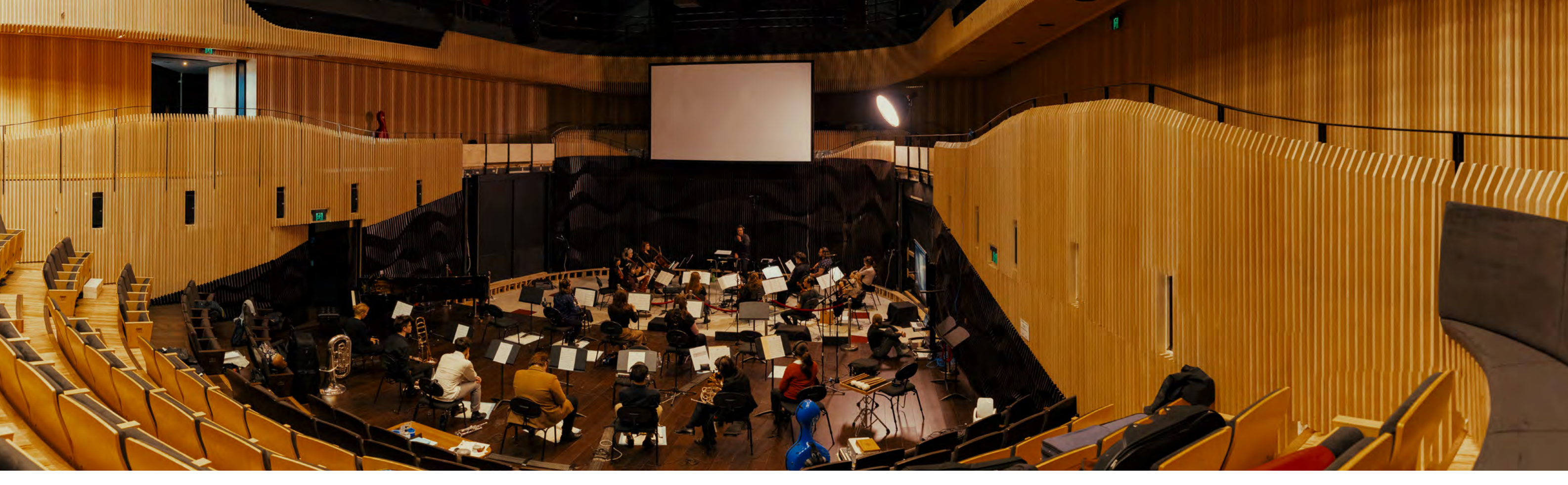
▲ Students performing for final assessment in The Ian Potter Recital Hall, the Hedberg, Hobart