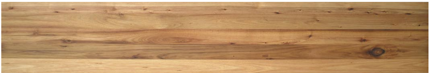
High Feature Grade (HF)