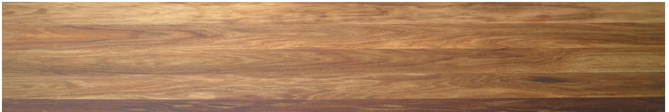
Select Grade (SEL)

All grades of timber are allowed the same amount of distortion; this is governed by product type rather than timber grade. Thus, a product of any grade can be expected to fit readily into its intended application. However, flooring or light decking of High Feature Grade may require knots or holes that approach the maximum size allowed to be trimmed out. A pack of timber of a particular grade will have a fair distribution of boards with the amount of feature allowed in that grade.