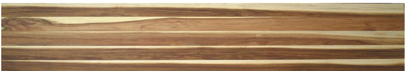
Black and White Grade (B&W)