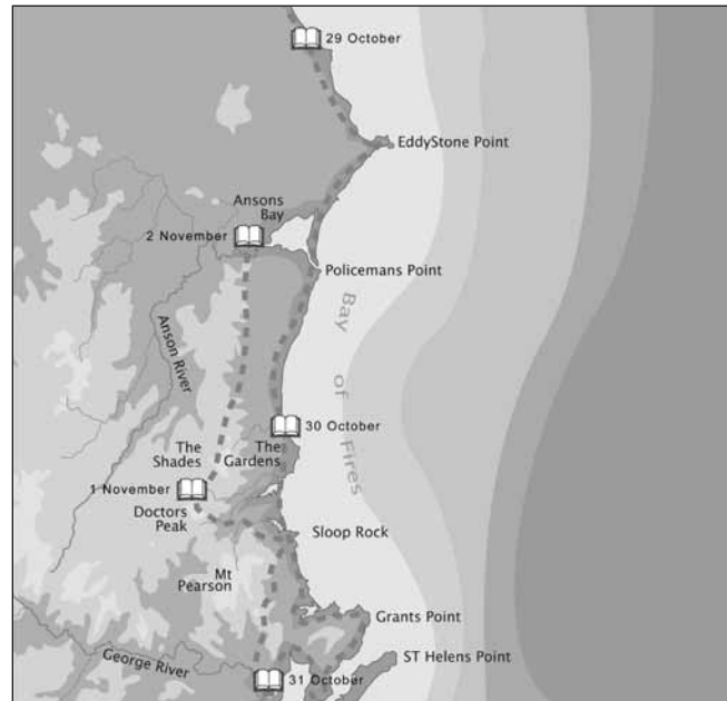
Figure 2. Map of research precinct with daily routes marked.