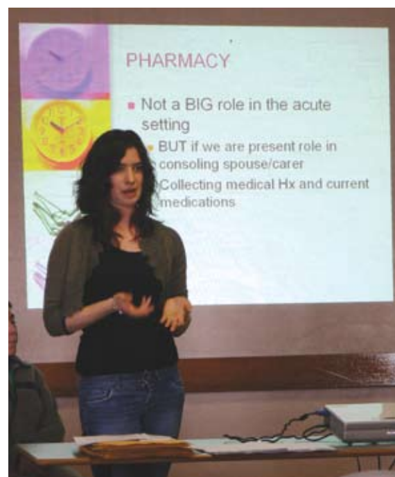
A student presenting at RIPPER

The presentation acknowledged that the contribution of local health professionals was crucial to the success of the program. The audience also appreciated the work required to set up and run such a program and the opportunities it presented for students to work and learn together over the weekend of activities. Another benefit of the weekend was that the health professionals assisting the program acquired some valuable professional development. The inclusion of pharmacy in such a program was appreciated thus highlighting to the audience ways in which this profession can participate and support interprofessional learning for a relatively