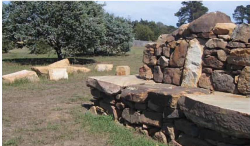
The Centre is surrounded by a community garden. This stone seat was built during the Oatlands Spring Festival last year by a stone wall builder from Scotland, workshoping with local people.

centres around Australia, the MMPHC is experiencing a reduction in the availability of health care professionals. It is making big efforts to overcome this challenge. In 2006 it hosted a first-year medical students' rural practice study day, facilitating interaction with community members and focusing on communication skills. It also hosts an annual Emergency Care course aimed at fifth-year medical students. They overnight in the community and spend their two days interacting with the local doctors, a number of visiting specialists, State Emergency Services personnel, and community members including the Hospital Auxiliary which provides catering for the course.