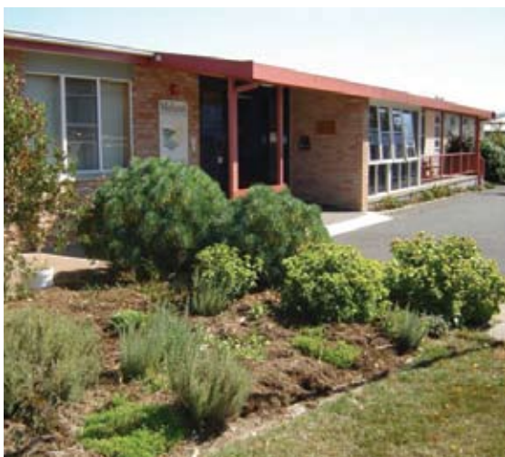
The Midlands Multi-Purpose Health Centre

Please visit www.ruralhealth.utas.edu.au/news/newsletter . Click [ Subscribe ] to input your email address for subscription.