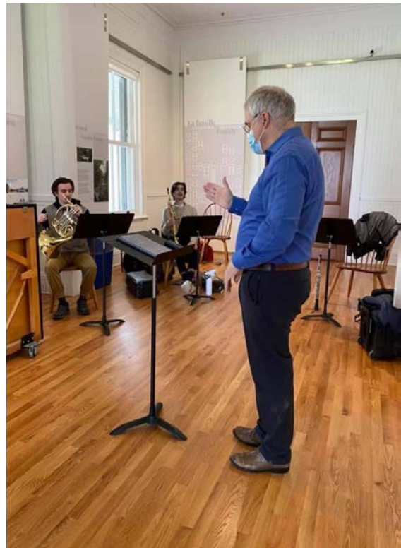
Rehearsing at "Les Jardins de Métis"