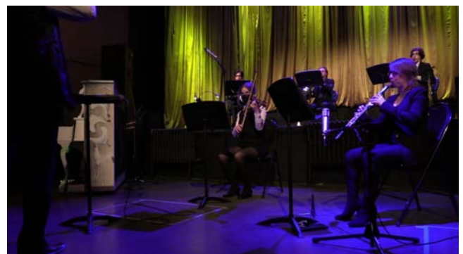
Le Kaléidoscope Musical in action!