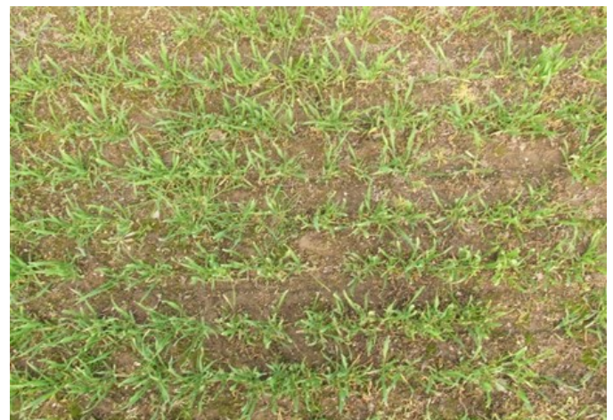
Figure 3: Sufficient biomass for grain recovery

Grazing dual purpose wheat varieties can have the added benefit of reducing lodging and disease as excessive vigour is managed through strategic grazing.