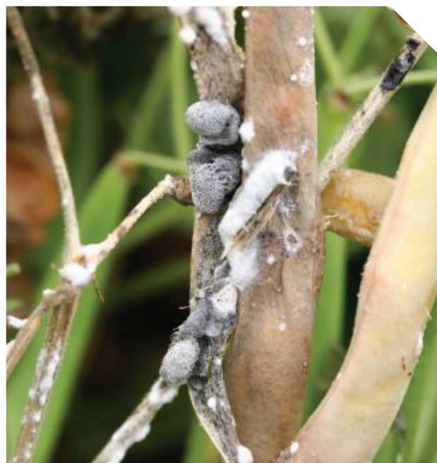
Figure 1. (a) Fluffy white fungal growth and (b) black resting bodies (sclerotia) on bean pods infected with sclerotinia.

Sclerotia can also form inside stems, flowers and fruit of affected plants.