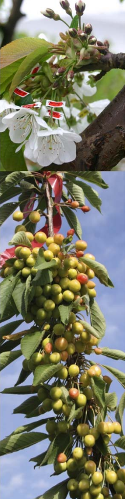
Above: A cherry limb not long after ethephon spray

Below: About 30 days after ethephon spray