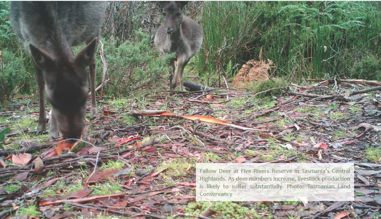
Fallow Deer at Five Rivers Reserve in Tasmania's Central Highlands. As deer numbers increase, livestock production is likely to suffer substantially.