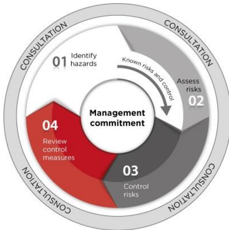
Figure 2. The risk management process

This process will be implemented in different ways depending on the size and nature of your organisation. Larger businesses or those where workers are exposed to more, or more serious psychological health and safety risks may need more complex and sophisticated risk management processes.