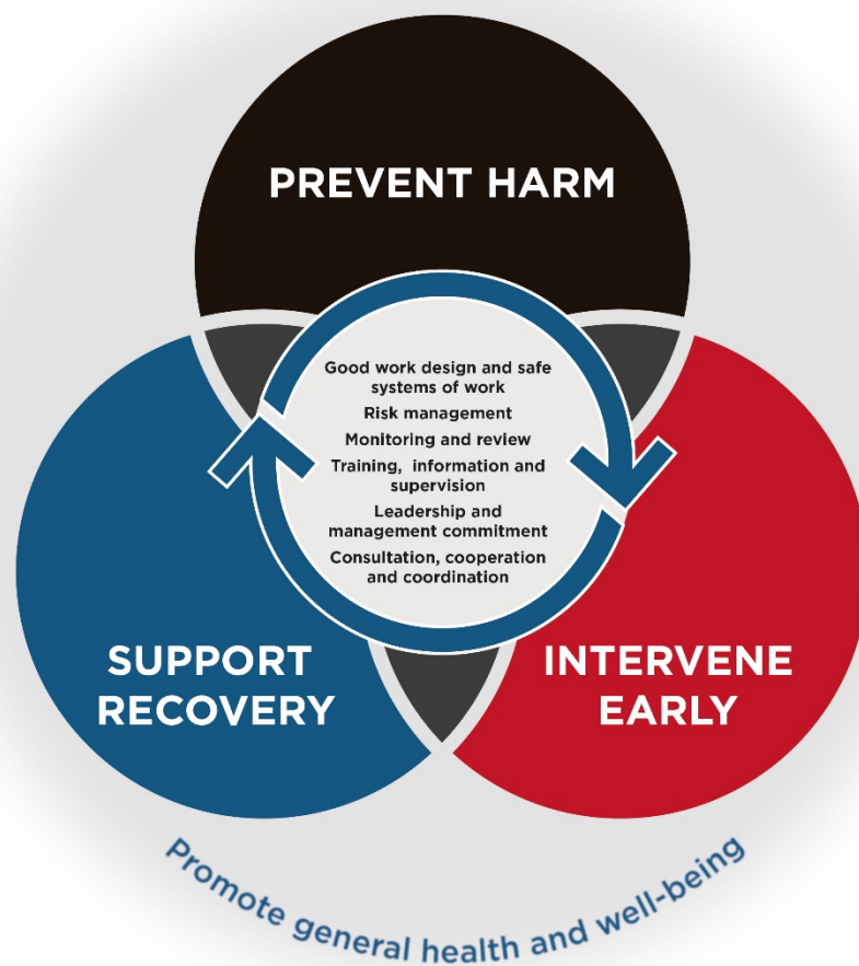
Figure 1. Systematic approach to psychological health and safety

Prevent harm – This element focuses on your duties under WHS laws. To do this you must systematically and comprehensively: