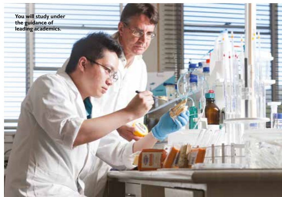
You will study under the guidance of leading academics.