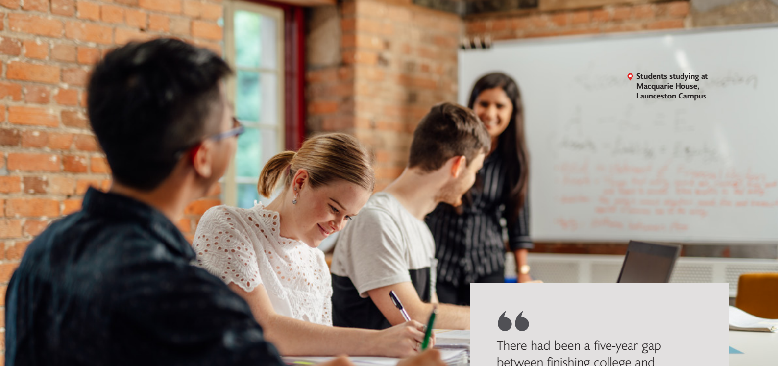
Students studying at Macquarie House, Launceston Campus