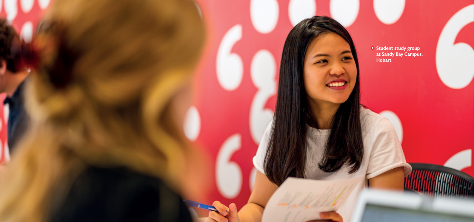
• Student study group at Sandy Bay Campus, Hobart