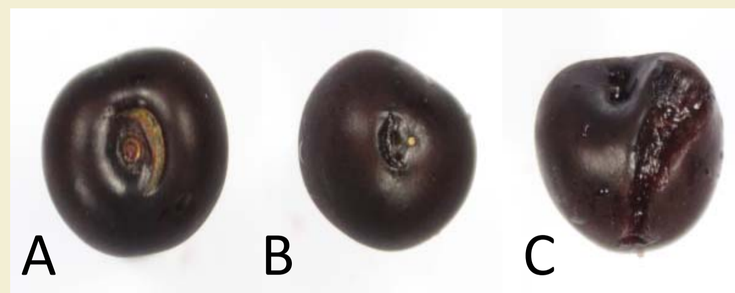
A = Stem-end, B= Apical-end and C = Side crack

Varietal differences in cracking susceptibility have been seen in Tasmania. In addition, varieties seem to be predisposed to crack in particular ways.