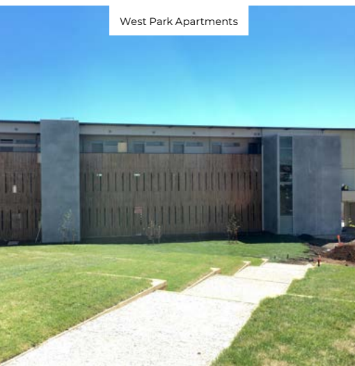
West Park Apartments

*Costs listed are per week for 2024 and are subject to change and NRAS eligibility. Refer to the website for the most up-to-date information.