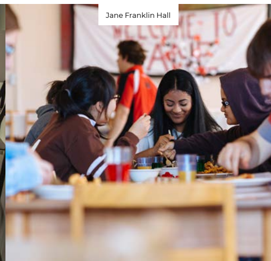
Jane Franklin Hall