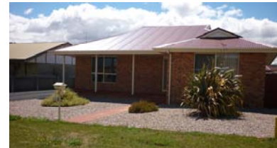
NEW CENTRE: Oatlands ready

The first stage of the project is almost finished with the development